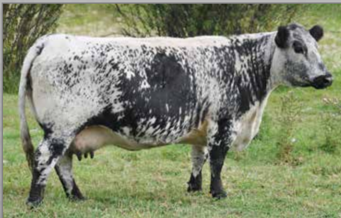
Dam of lot 17: CODIAK UNIQUE GNK 8R

SELLING 50% POSSESSION & 50% SEMEN INTEREST. Codiak Acres is drawing in-herd-use semen and retaining Australian semen rights. 105D is a bull we really like here at Codiak. This is a bull we feel could add a lot to any herd. He is handy enough for a show string as well! Of course being out of the legendary 8R cow doesn't hurt him at all either. He tested at the highest end of the genetics testing.