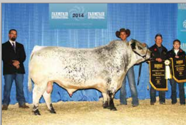
RIVER HILL 60W LINE DRIVE 54Z

FEB 25, 2010 • BMZ 3X • -[CAN]3435- PT Calamasue 46U X Hwy 4 6G