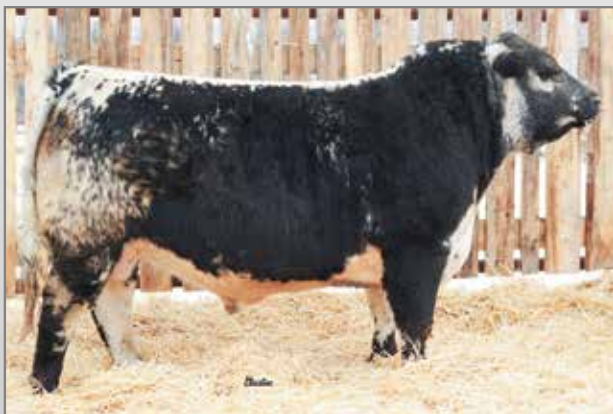
CODIAK SCAPE GOAT GNK 88A

APRIL 11, 2013 • GNK 88A • -[CAN]4559- PB River Hill Yager X P.A.R. Nigel