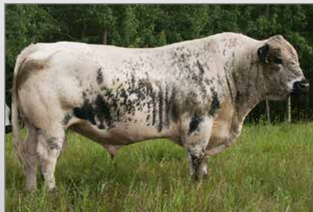
MOOVIN ZPOTZ FALCON 3X

APRIL 11, 2013 • GNK 88A • -[CAN]4559- PB River Hill Yager X P.A.R. Nigel