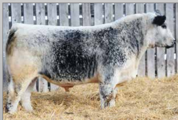
RIVER HILL 50T CRUSADER 025C

MARCH 6, 2012 • BED 54Z • -[CAN]3841- PB River Hill 26T Walker 60W X Lacerta 68L