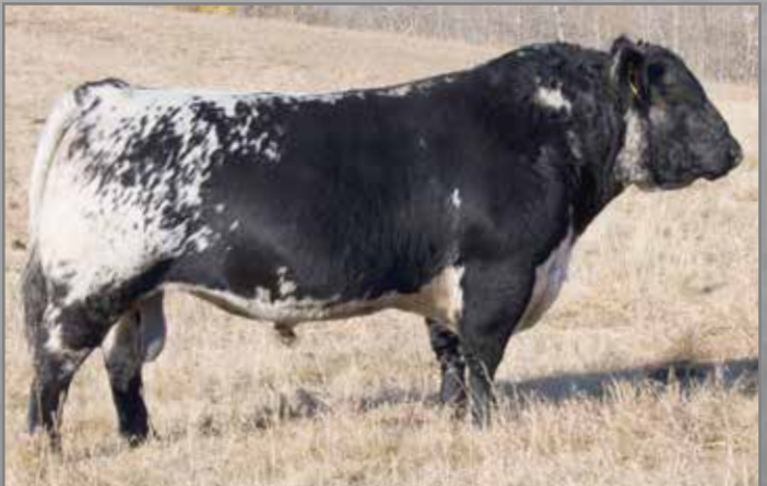
Sire of lots 38 & 39: CODIAK CRIKEY GNK 13U