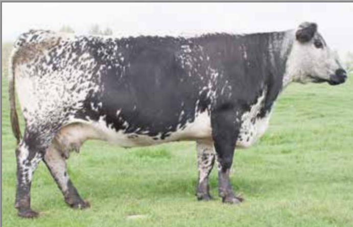
Dam of lots 38 & 39: RIVER HILL SHOW ME OFF 60S