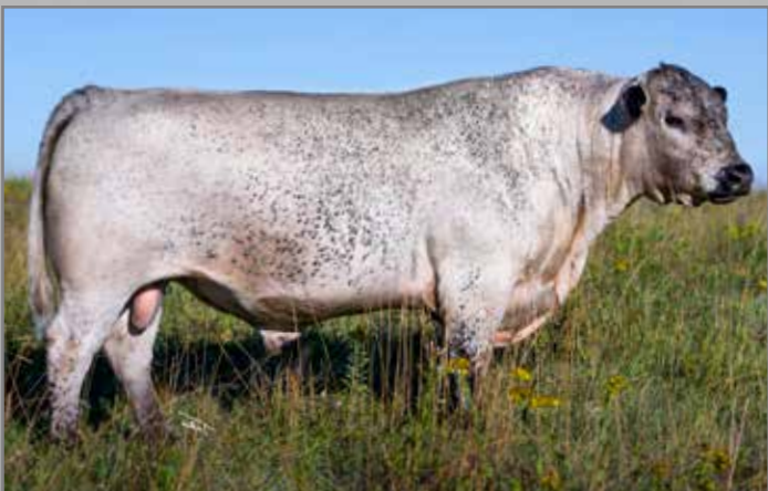
Sire of lot 17: RIVER HILL 26T YAGER 99Y