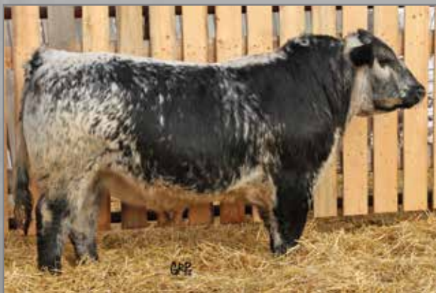
CODIAK TYCOON CAT GNK 12Z

JAN 31, 2015 • BED 025C • -[CAN]5357- PB Touchdown 50T X Traffic Jam 26T