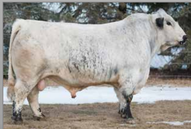
COLGAN'S BAXTER 1B

APRIL 1, 2012 • GNK 12Z • -[CAN]4189- PB Legacy Unrivaled 12U X River Hill Skipper 6S