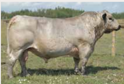
RIVER HILL 25Y ALEXIA-JADE 59A X CODIAK OH MY GOSH 60A