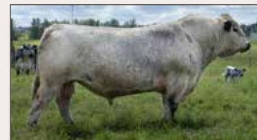
Codiak Monument GNK 107D

You are purchasing a recip that has been implanted with the above mating and confirmed safe in calf to the embryo.