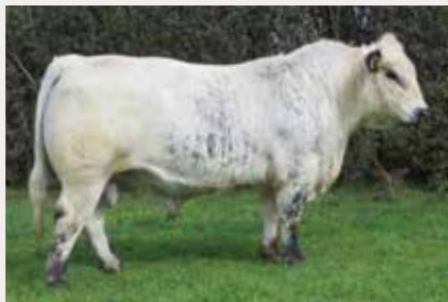
TUMBLEWEED ACRES DAISY 10X X PREMIER 101Y LOGIC L11