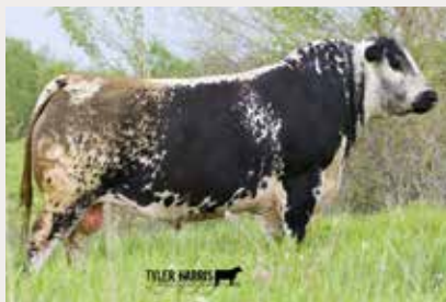
RIVER HILL 25Y ALEXIA-JADE 59A X CAJA ZEPPELIN 1B