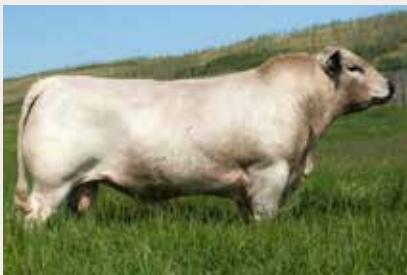
RIVER HILL 26T SHOW ME Y 60Y X RIVER HILL 50U ALL IN 60A