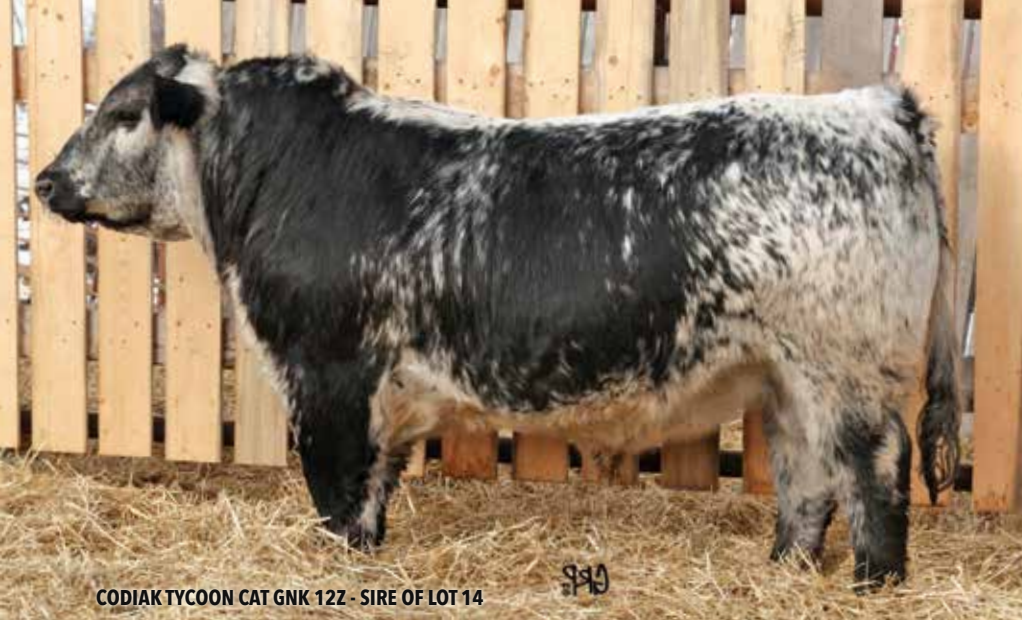
CODIAK TYCOON CAT GNK 12Z - SIRE OF LOT 14